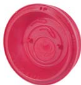
Poly II Pipe Seal