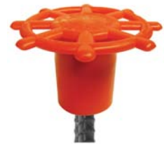
3024-OSC-SG (#3 - #8 OSHA Cap) 3024-OSC-SG2 (#9 - #18 OSHA Cap)