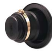
Poly VI Closed End Boot Seal