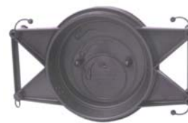
Baffle/Filter Ready Seal