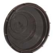
4" D-Box Seal & Nut