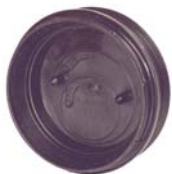
Poly I Pipe Seal