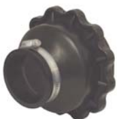
2" Open End Boot Seal