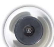
Mandrels / Magnetic Mandrels