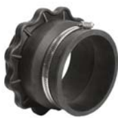
Poly IV Open End Boot Seal