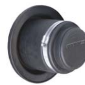
Poly III Closed End Boot Seal