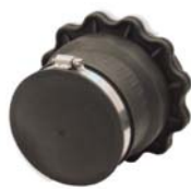
Poly IV Closed End Boot Seal