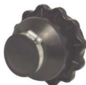
2" Closed End Boot Seal