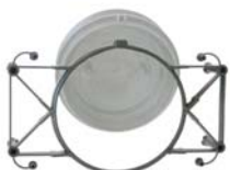
Universal Ready Adapter