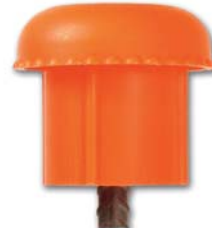
3024 (Protective Cap)

OSHA Rebar Safety Caps are safety orange color and are of use where the danger of impalement is present. OSHA rebar safety caps fit #3 - #8 rebar and #9 - #18 rebar.